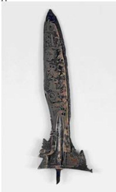
Picture 2. The Amsterdam Tropen Museum's Keris Collection with Inventory Number of TM-6046-1