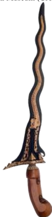
Picture 8. The Dragon Keris Inventory Number A-5864 (TM) in the collection of the Amsterdam Tropical Museum (Groneman, 2009:83)

The final section of this discussion emphasizes the meaning of keris that cannot be standardized easily. The meaning of the keris is always in the process (in the making) according to the demand and literature abilities of the subject. The illustration below is an example of a dragon depiction, which is very different from the Keris Diponegoro mentioned in the introduction. This keris is a collection of the Amsterdam Tropical Museum with Inventory Number Nr. A-5864. The dragon figure depicted in the keris is not in the form of a three-dimensional relief as seen in Diponegoro's keris but two dimensions employing the gold inlay technique. The headgear worn by the dragon is not a Javanese king's crown, but it is in European style. There is an explanation 'that seems to suck the blood channels empty' in the caption accompanying this keris (Groneman, 2009: 83), and the Javanese would easily guess this keris as an allusion to the Dutch Colonial.