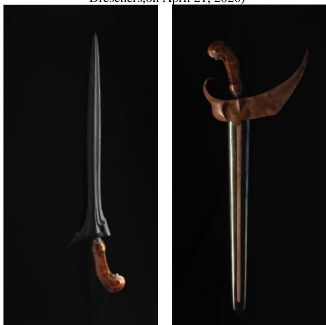
Picture 6. Keris with dhapur Jalak Dinding (picture and artifact are the collections of Dietrich Dreschers, on April 21, 2020)

The code's arrangement in a dhapur and ornaments are clearly seen in Dietrich Dreschers's collection in